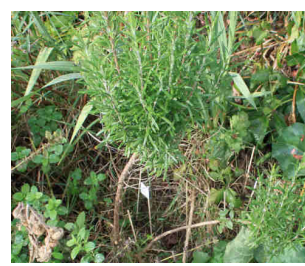
Fig. 5 Installed tea bags on different sites (left: intensive right: mixed culture with perennial herbs.