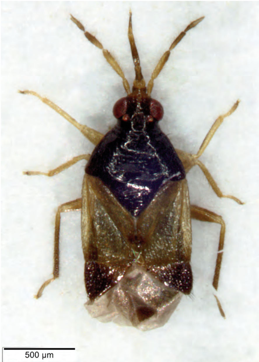
Fig. 4. A male Orius laevigatus laevigatus (Fieber, 1860) from Zurich sampled during the Better-Gardens arthropod survey. The species can be morphologically distinguished from species of the Heterorius subgenus by the presence of black setae on the edges of the pronotum, and from Orius niger by the pale middle-legs and the slightly obscured hind-legs, which are all black in O. niger .