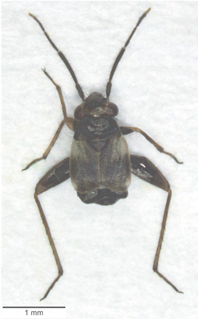
Fig. 3. A male Chlamydatus saltitans (Fallén, 1807) from Zurich sampled during the BetterGardens arthropod survey. The species can easily be distinguished from the other three Central European Chlamydatus species with its mat hemelytra, having parts of lighter colour and only a narrow rest of the membrane.