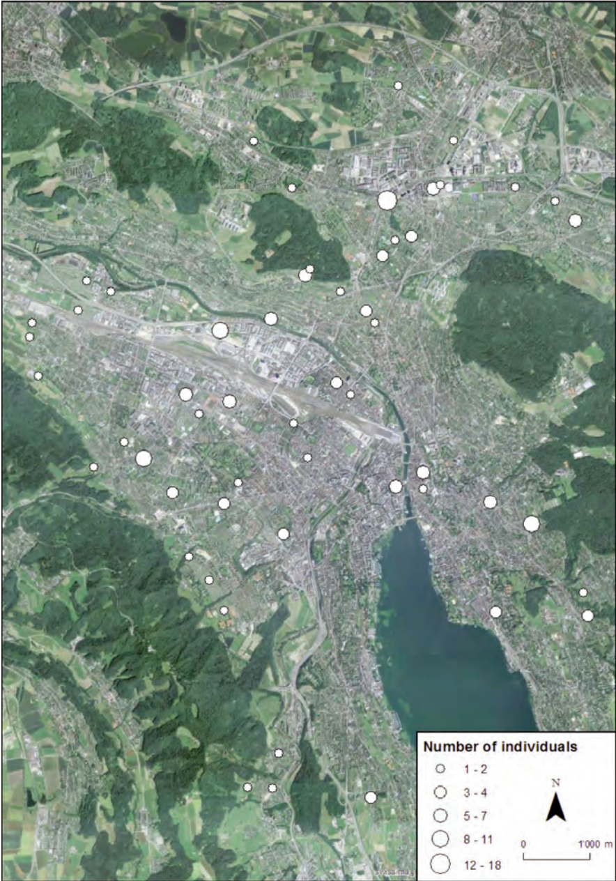
Fig. 5. Occurrences and abundance of the alien true bug Halyomorpha halys (Stål, 1855) in the City of Zurich sampled during the BetterGardens arthropod survey between May 18th and August 19th 2015.