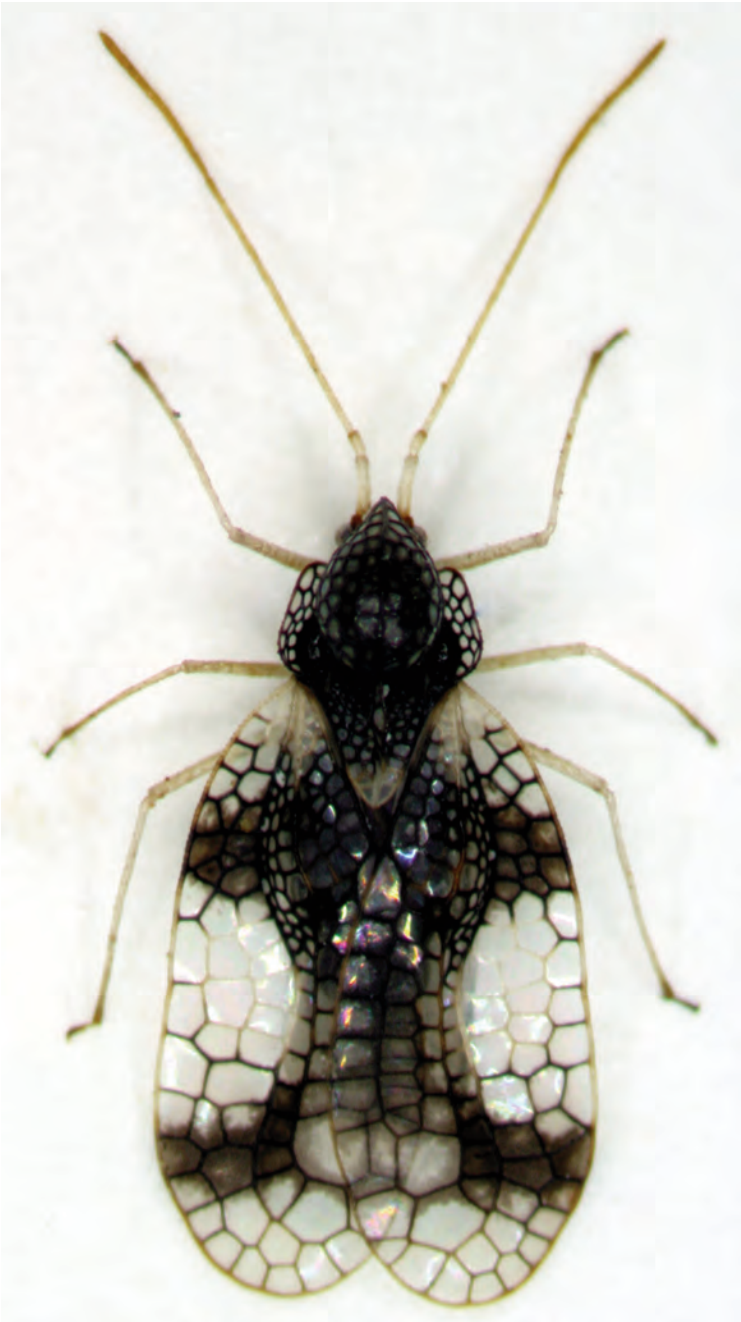
Fig. 1. A male Stephanitis takeyai (Drake & Maa, 1955) from Zurich sampled during the BetterGardens arthropod survey. The body-length is slightly below 4 mm. The main difference to European species of the genus is the larger and more rounded neck bubble.